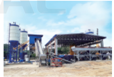
● HZS60 in Manila, Philippines