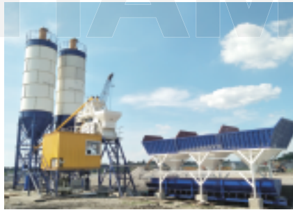
● HZS50 batching plant