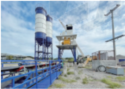
● HZS90 in Cebu, Philippines